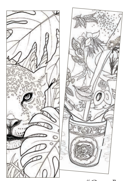
"Jaguar" color-in bookmark