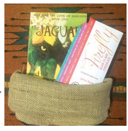
Burlap snuggle (Firefly Chocolate shop display)