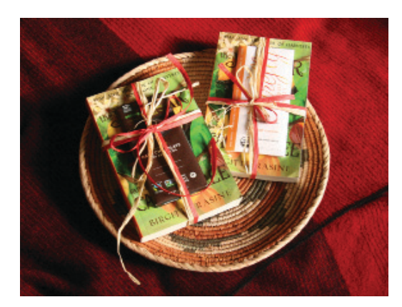
Double-dipped in red (Author's Edition)