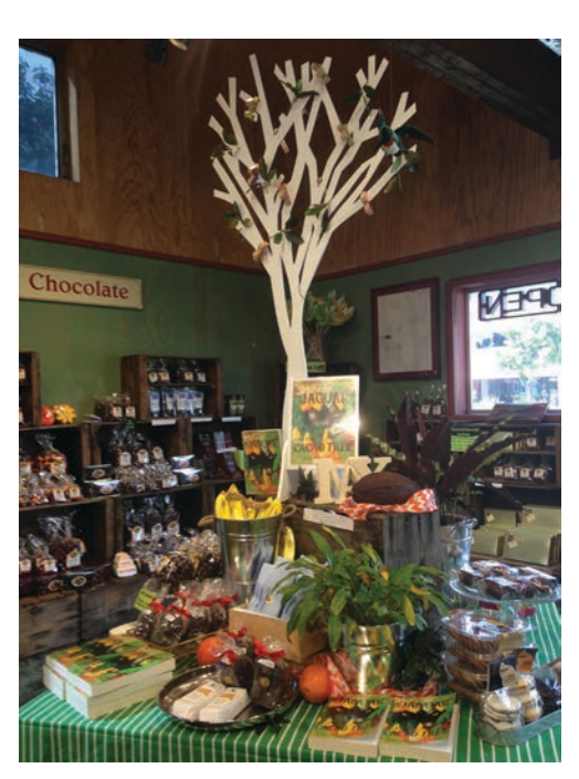
Cacao Tree display (Table display at CJ Olson's)