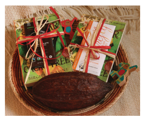
Two monkeys and a cacao pod (Kids Edition)