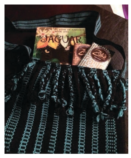
Hand-made (Zak's Chocolate store display)